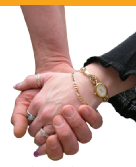
accepting of life. Made me very grateful for the daughter I had before Cushings disease was diagnosed"

"Made my marriage stronger. Made me more