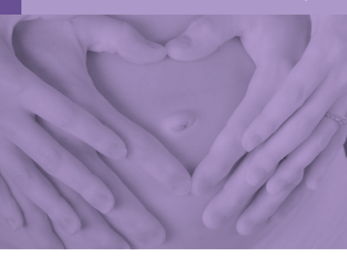
The Pituitary Foundation Information Booklets